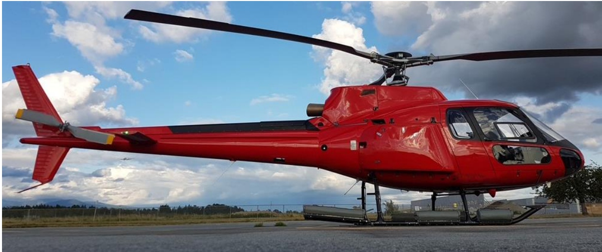
Helicopter SN: 3296

Airbus Helicopter AS350B2 with Soloy SD2 Kit.